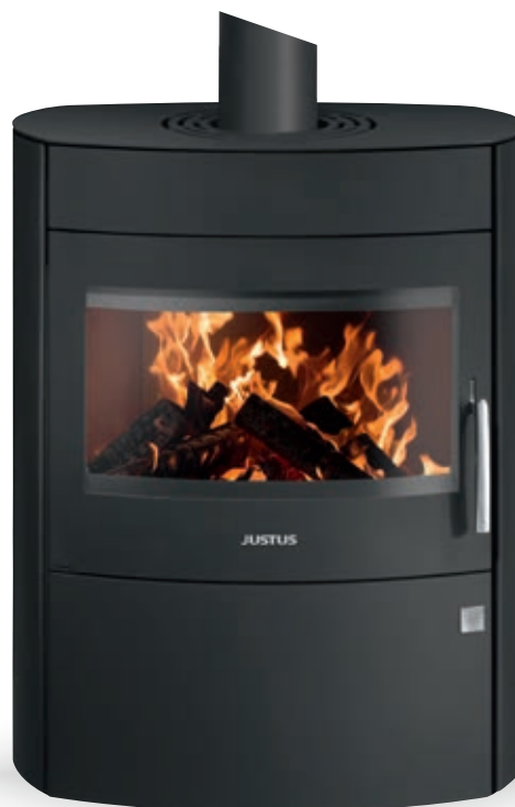
Agero 2.0, steel black