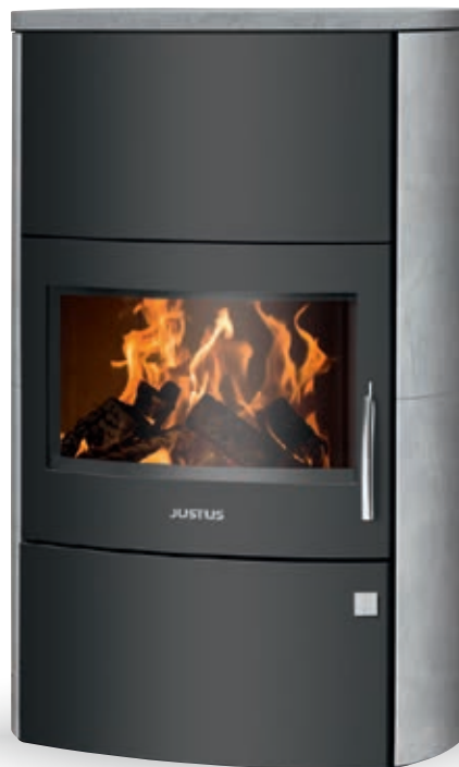
Agero W+. Soapstone, corpus steel black

The connecting piece for external combustion air is included in the scope of delivery and is already mounted.