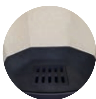
Solid cast iron base