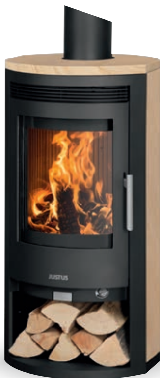
Baltrum D, Sandstone, corpus steel black