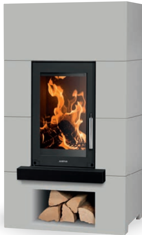
Centro, mantel concrete slate