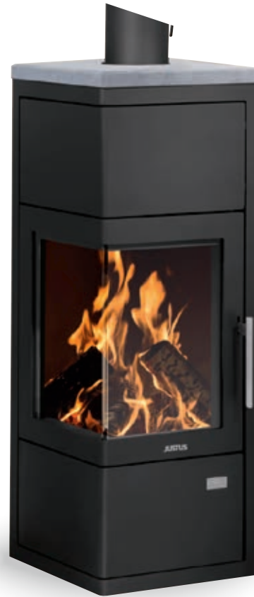
Diego W+ Steel black with cover plate Soapstone

Please order the connecting piece for external air connection separately.