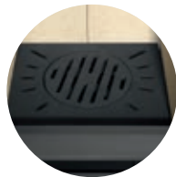
Solid cast iron base