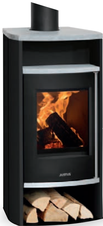
Frisco 2.0, steel black, cover plate and warming compartment in soapstone