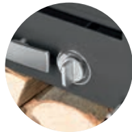
Automatic primary air control