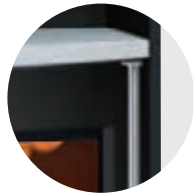
Ergonomic bar handle