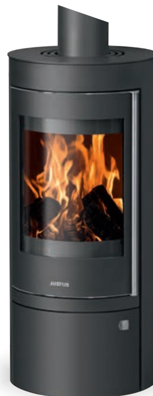
Mino Top 2.0, steel black