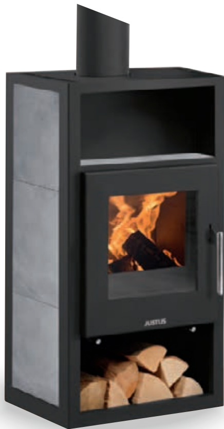
Texas Soapstone Ceramic, corpus steel black