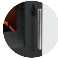
Air flow handle