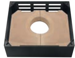
Illustration shows E-Blok with heat accumulation stone. D-Blok same illustration without heat accumulation stone.

Can be extended by up to 3 additional segments (E-Blok or D-Blok). Height: 147 mm per E-Blok.