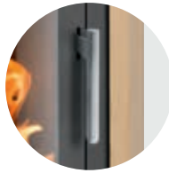
Air flow handle