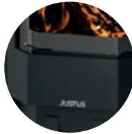
Solid cast iron door