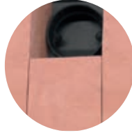
Heat accumulation stone W+, approx. 35 kg