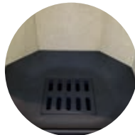
Solid cast iron base with cast iron grid