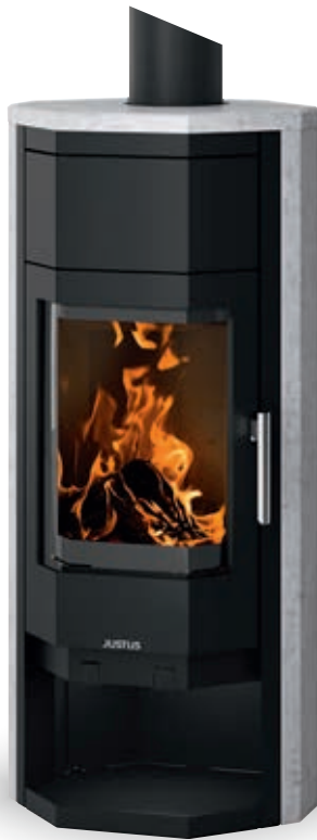
Usedom 5 W+ 2.0 Soapstone, corpus steel black