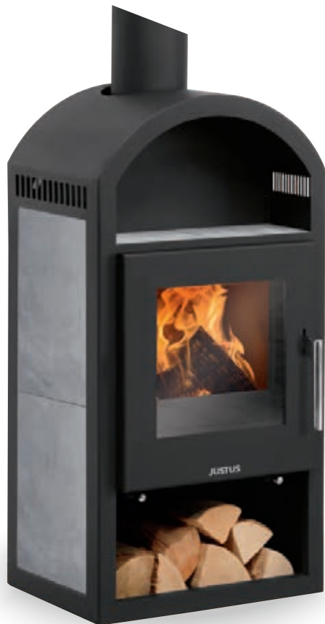
Texas, Soapstone Ceramic, corpus steel black