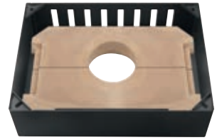
Illustration shows E-Blok with heat accumulation stone. D-Blok same illustration without heat accumulation stone.

Can be extended by up to 3 additional segments (E-Blok or D-Blok). Height: 170 mm per E-Blok.